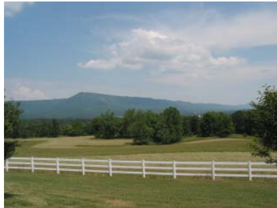
Easements and Agriculture

Easements and Agriculture. This project involved localities, land conservation and farming groups, attorneys and farmers themselves to look at barriers and opportunities to making permanent farmland conservation more widespread in agricultural areas of Virginia. It provided insights for establishing specific agricultural easement programs and strengthening county purchase of development rights programs that have sparked continued work in this area across the state.