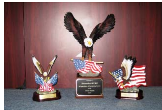
Southeastern RC&D Awards to Shenandoah RC&D.