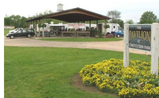
Waynesboro Farmers Market

Waynesboro Farmers Market - II. A group of citizens restarted the Waynesboro Farmers' Market (WFM) in 2008 and this project supported their efforts by providing funds to pay a market manager for the third year. This season, the market manager recruited additional vendors and directed market promotions. The WFM Committee supplemented the RC&D Council grant and solicited donations from local business in the Waynesboro area. www.shenandoahrccd.org/WFM.htm (Waynesboro/Augusta County)