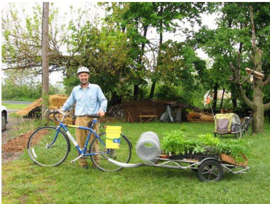
Muddy Bike Project

New Community Project II. This was the second season for the Muddy Bike Urban Garden Project, an organic market garden in Harrisonburg that trained and employed five people in a homeless or transitional situation. The garden expanded in 2010 to selling at three local restaurants as well as part-time sales at the Harrisonburg Farmers Market. The second component of this project was an expansion of community gardens at local trailer courts and churches. These helped low-income and transient populations have access to fresh vegetables, as well as allowing some produce to be donated to a local food bank. It was estimated that there was at least $500 worth of food savings per household food budget with the garden project. (Harrisonburg/Rockingham County)